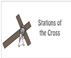
Stations of the Cross

As a special gift from the Lord this year, Ash Wednesday falls on the day of love. This gives us a wonderful opportunity to begin the Lenten season with a reminder that love is our compass. The Lord desires our whole heart, and today we are called through the prophet Joel to “return to me with your whole heart” (Joel 2:12). During Lent, we must repent and return to Christ. Seize the possibilities of Lent—take a step closer to God!